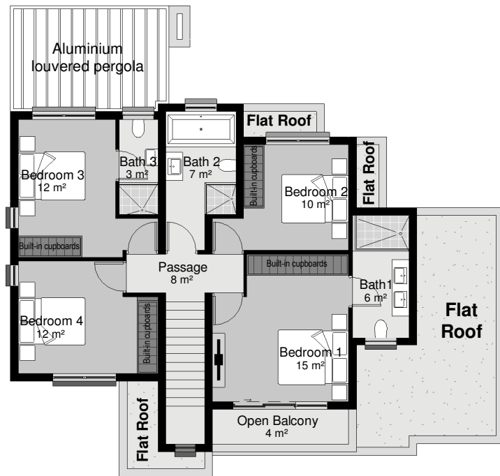
First Floor Plan (4 Bed)